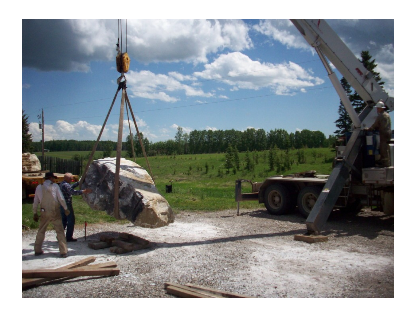
Tanja's stone is the largest (about 12,000lb) It still amazes me that in a months time these stones will be incredible works of art.